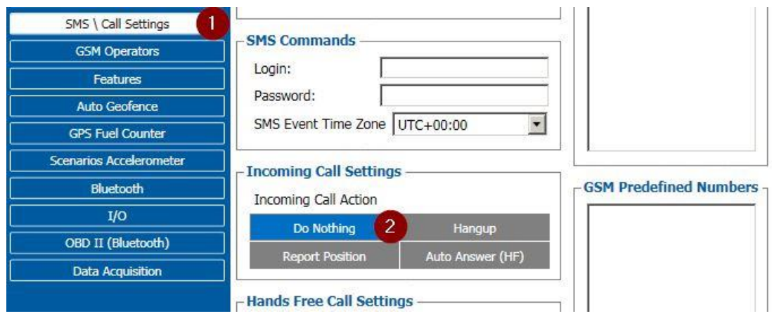
Figure 3. Incomming Call Action settings.